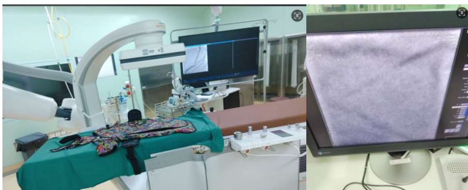
Figure 3. DSA machine detection

Method 2 uses DSA for quality control testing. The DSA flat-panel detector measures 399mm × 299mm, has a limited scanning range, and operates at a slower bed movement speed. Adjusting the scanning position takes time, and different positions must be set for protective suits of varying sizes. Additionally, the DSA room is equipped with an automatic sliding door in the operating room, which further increases the time required for personnel to enter and exit. Using DSA to test protective suits, aprons, and neck covers (two pieces each), the total time required for positioning, scanning, and reviewing images after scanning completion is approximately 15 minutes, averaging 2.5 minutes per piece.