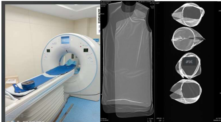
Figure 2. CT machine detection

Method 2 uses DSA for quality control testing. The DSA flat-panel detector measures 399mm × 299mm, has a limited scanning range, and operates at a slower bed movement speed. Adjusting the scanning position takes time, and different positions must be set for protective suits of varying sizes. Additionally, the DSA room is equipped with an automatic sliding door in the operating room, which further increases the time required for personnel to enter and exit. Using DSA to test protective suits, aprons, and neck covers (two pieces each), the total time required for positioning, scanning, and reviewing images after scanning completion is approximately 15 minutes, averaging 2.5 minutes per piece.