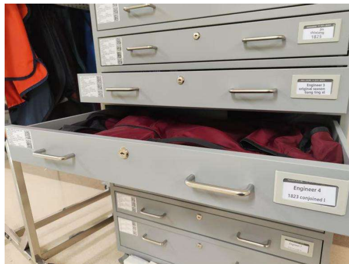
Figure 1. Cabinet storage and labeling of assets

Program 5, Purchase multi-tiered metal flat drawer cabinets, with each cabinet capable of holding 10 sets of protective clothing, cabinet door posted asset labels and users, to achieve protective clothing, users and storage cabinets one-to-one correspondence, asset labels are not easy to damage, basically lifelong without replacement, the information to view direct, two-dimensional code intuitively presented, rapid scanning code is very convenient, in the department with the cooperation of the department, regular training of department staff, strengthened the use of personnel With the cooperation of the department, regular training is provided to the staff of the department, which strengthens the management of the users, and one-to-one correspondence is achieved in accessing and returning, and at the same time meets the requirements of clinical use and refined management.